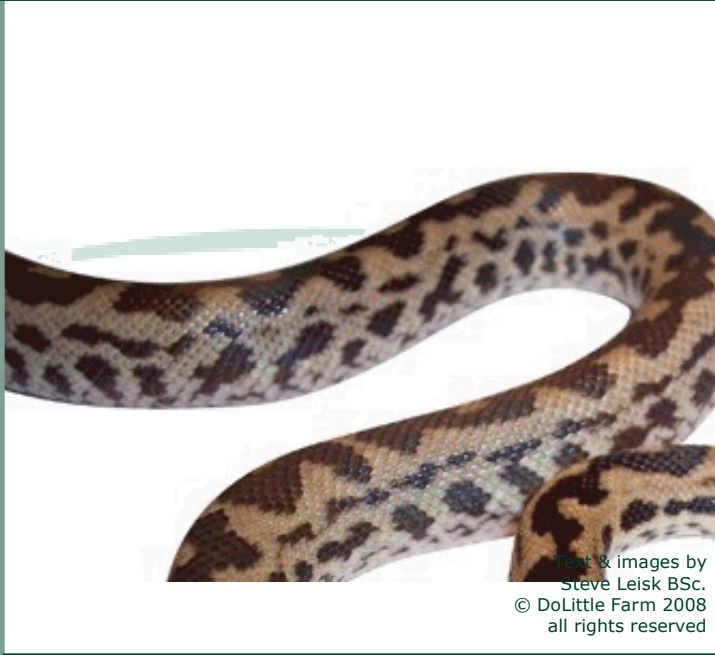
Text & images by Steve Leisk BSc. © DoLittle Farm 2008 all rights reserved