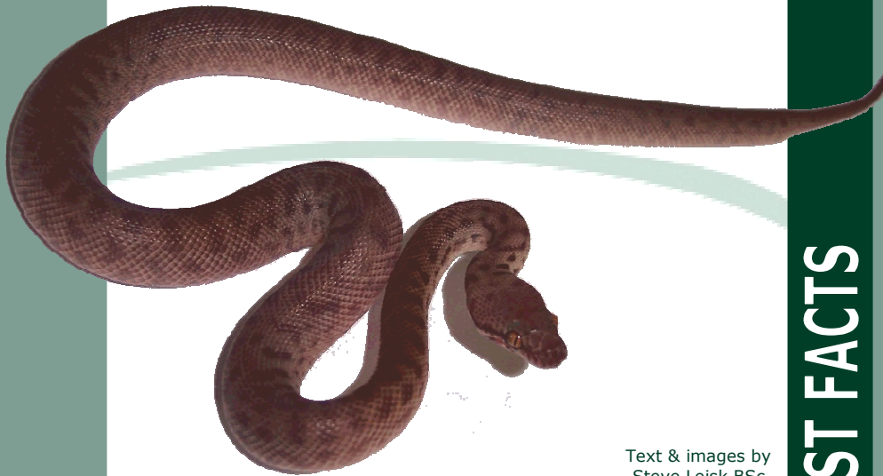
Text & images by Steve Leisk BSc. © DoLittle Farm 2008 all rights reserved